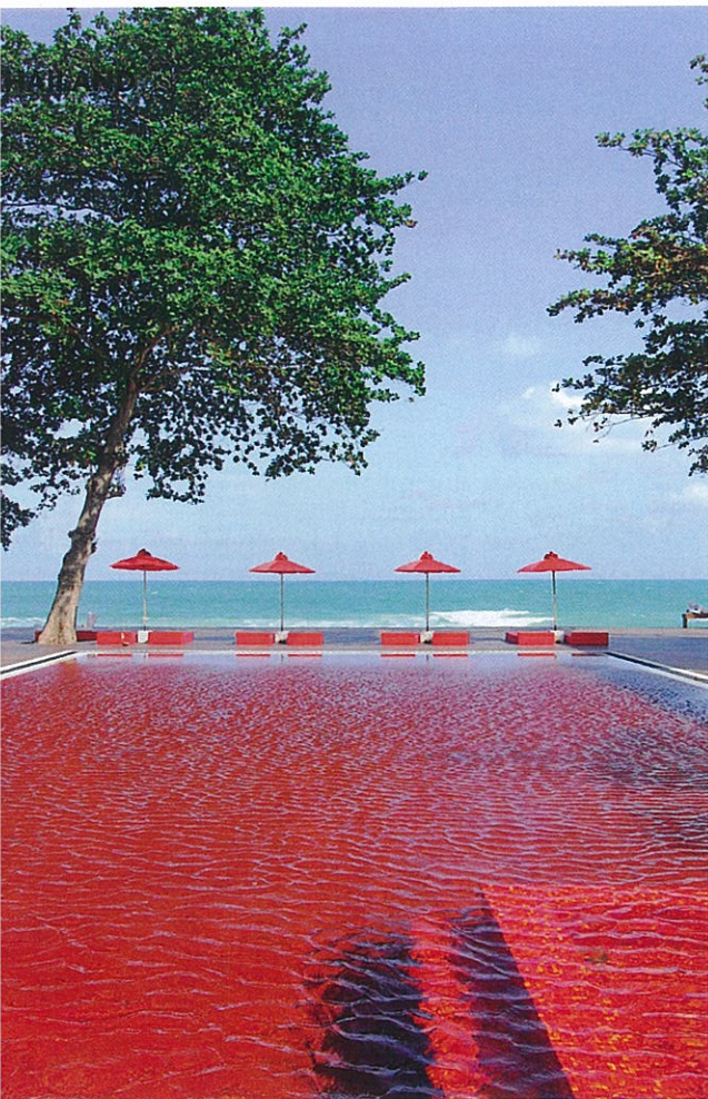
The Library: gaze at the horizon from the vermillion-tiled pool or relax amid elegant minimalism (left and below)