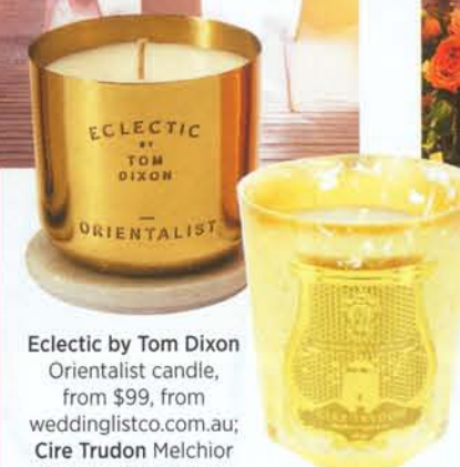
Eclectic by Tom Dixon Orientalist candle, from $99, from weddinglistco.com.au ; Cire Trudon Melchior candle, $120, from beckerminty.com .