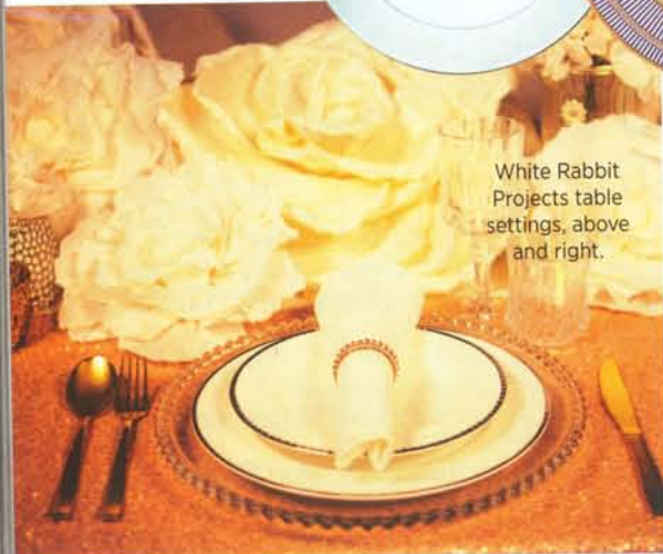
White Rabbit Projects table settings, above and right.