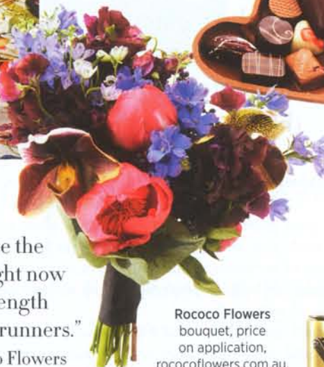
Rococo Flowers bouquet, price on application, rococoflowers.com.au .