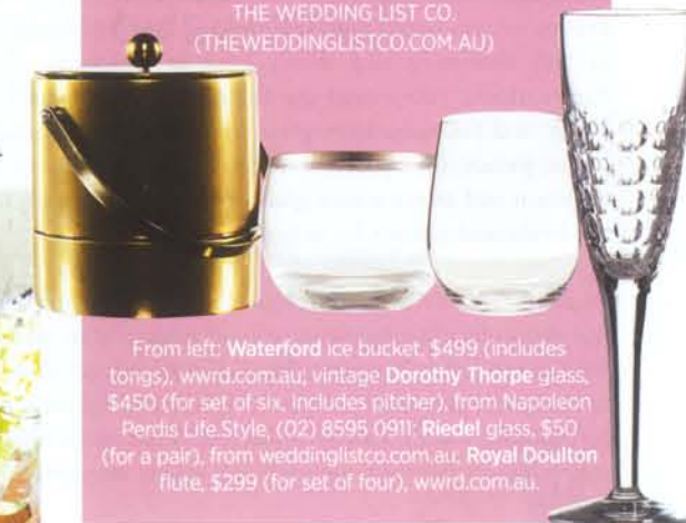
From left: Waterford ice bucket, $499 (includes tongs), wvrd.com.au ; vintage Dorothy Thorpe glass, $450 (for set of six, includes pitcher), from Napoleon Perdis Life.Style, (02) 8595 0911; Riedel glass, $50 (for a pair), from weddinglistco.com.au ; Royal Doulton flute, $299 (for set of four), wvrd.com.au .