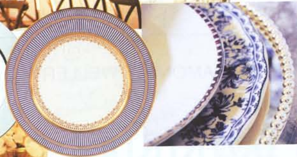
From left Jasper Conran plate, $199 (for five-piece set), and Wedgwood & Bentley plate, $229, both from weddinglistco.com.au .