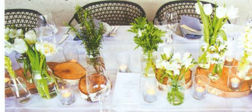
A Georgeous wedding.